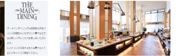
ABF: Buffet style