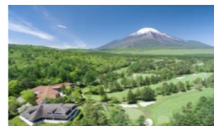
Fuji Golf Course